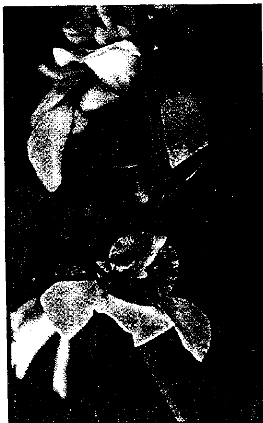
White diuris, Diuris punctata var. albo-violacea , now almost extinct.