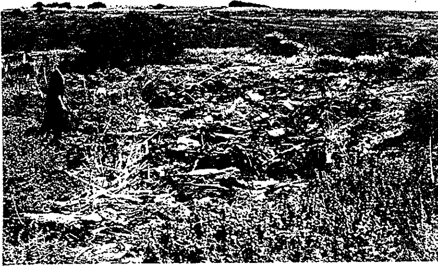
Horehound, boxthorn and rubbish—the car park area in 1972.