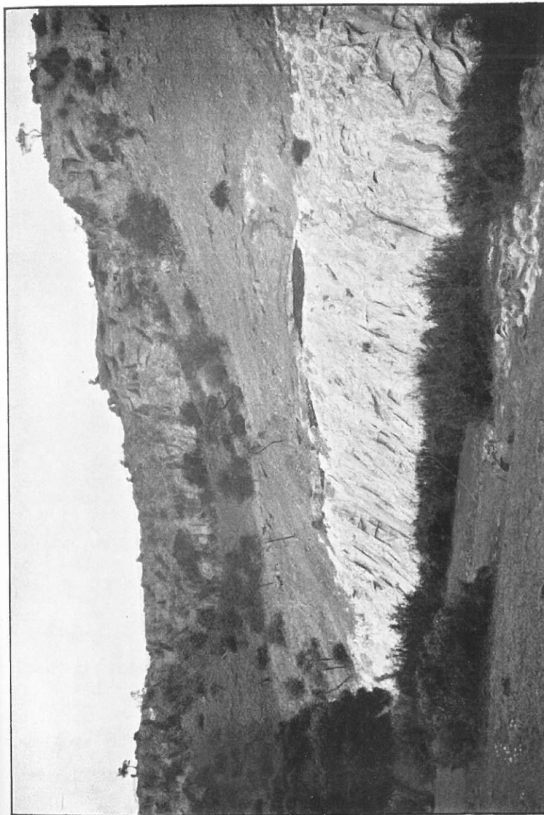
Eagle Rocks. (The crags in the upper part, where the Eagles nested, are basalt (lava) rock. As a deep flow this overlies Silurian gold-bearing sandstone, now exposed by the action of the creek.)