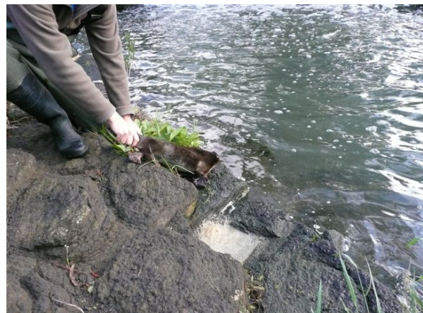
Releasing at Sunbury Water Treatment Plant