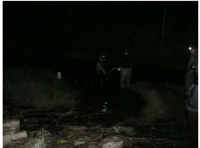
Organ Pipes National Park, Tessellated Pavement