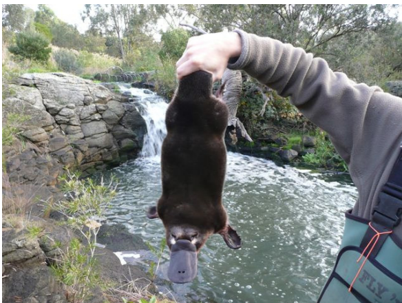
Waterfall Sunbury Water Treatment Plant